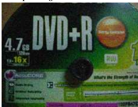
Input Image with Gaussian Noise

The calculated values for different filters for given input image: