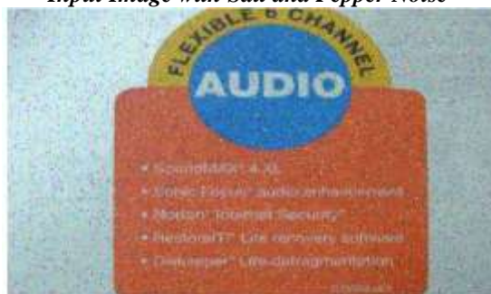
Input Image with Salt and Pepper Noise

The calculated values for different filters for given input image: