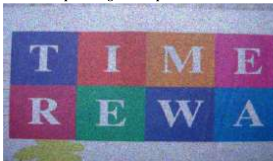
Input Image with Speckle Noise

The calculated values for different filters for given input image: