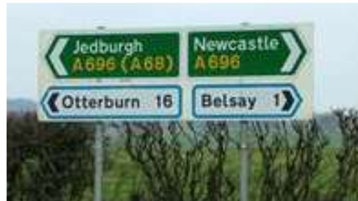
Figure1: Original Image [8]

in section III. Section IV and V includes the performance metrics and results simulated using MATLAB. In Section VI there is a brief conclusion.